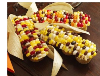
Indian Corn Cupcakes