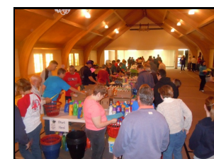
Thanksgiving Baskets Assembly Line

Year by the county's Community Foundation. They were presented $500 for OM ministries, and in December OM received an additional $800 for the annual Thanksgiving basket program.